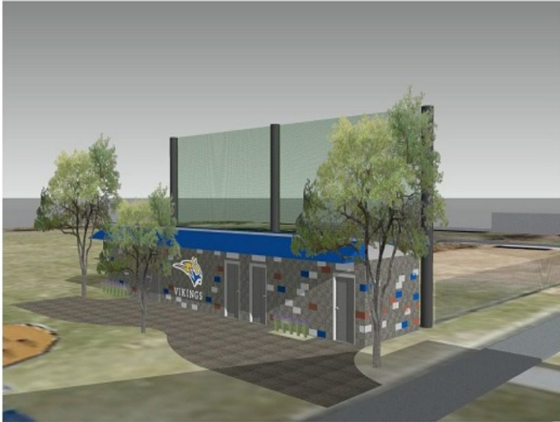
ST. ALBERT THE GREAT CATHOLIC CHURCH FIELD RESTRM. 01.18.24