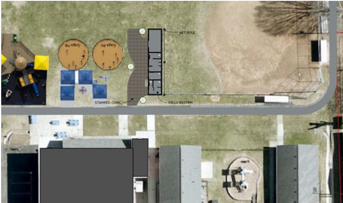
ST. ALBERT THE GREAT CATHOLIC CHURCH FIELD RESTRM. - SITE 01.18.24